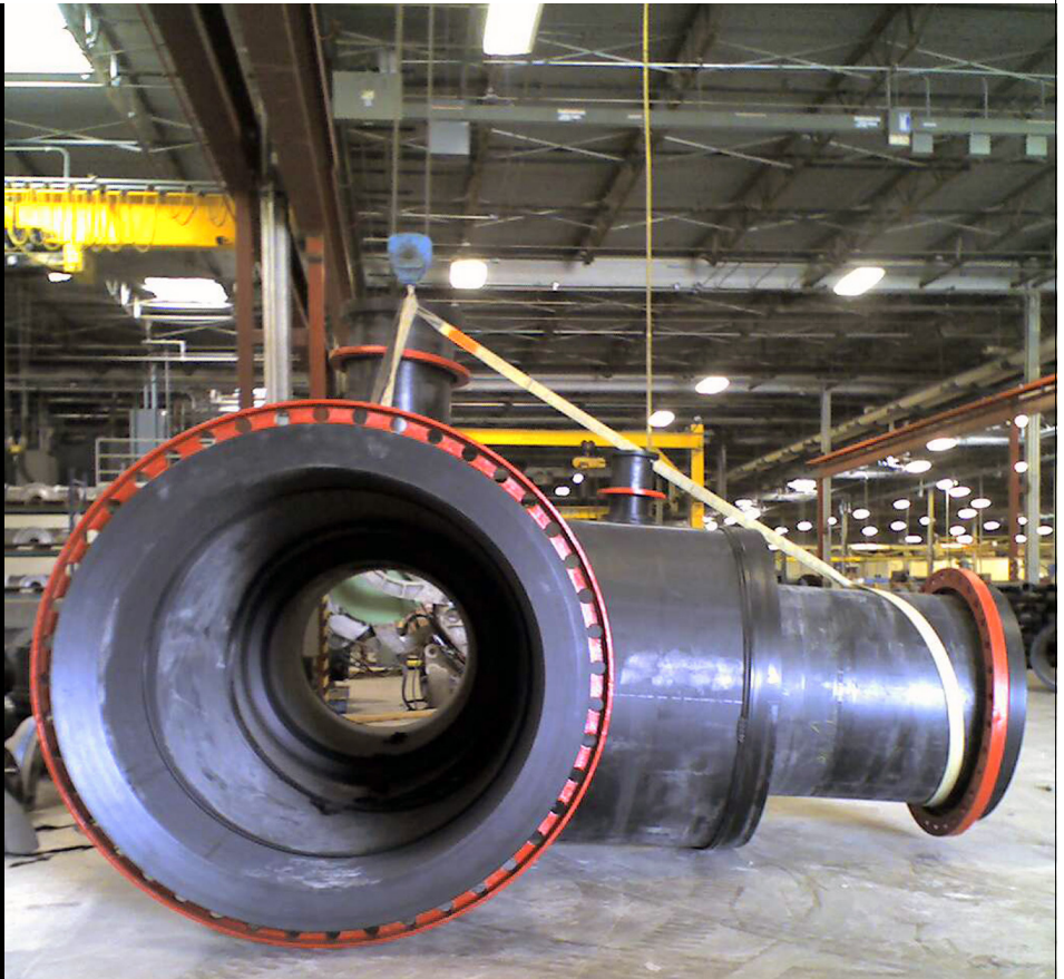
This massive custom T-section produced by Independent Pipe Products utilizes King PipeGrade® PE 100 material in multiple components of the pipe.